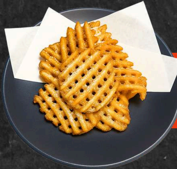
Garlic Waffle Fries $7