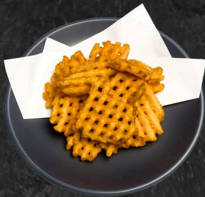
Curry Waffle Fries $7