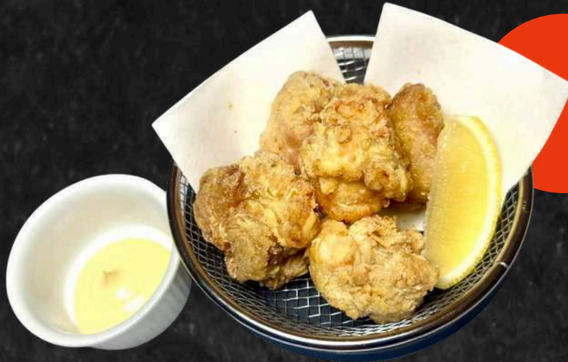
Garlic Kara-age $15