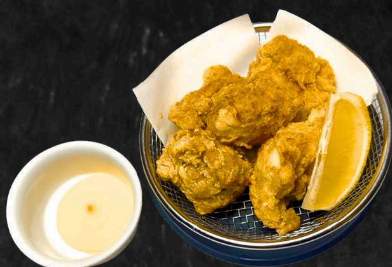
Curry Kara-age $15