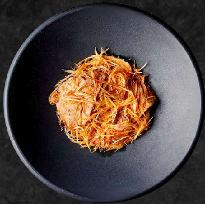
Spicy negi chashu $6