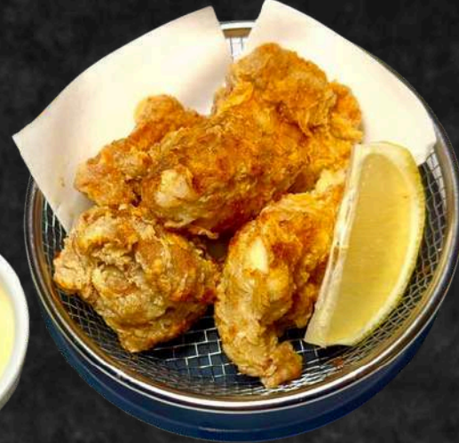
Spicy Kara-age $15