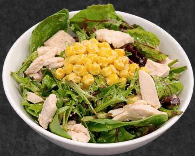
Salad with Chicken $3 (Sesame-Dressed)